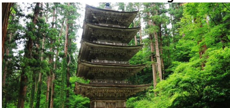
5 storied pagoda in Mt. Haguro