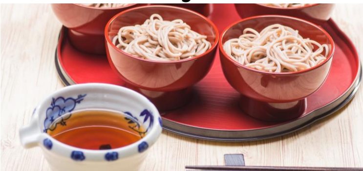
Wanko Soba - Iwate