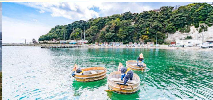
Tub fishing boat- Sado