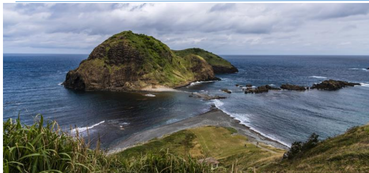
Sado Island - Niigata