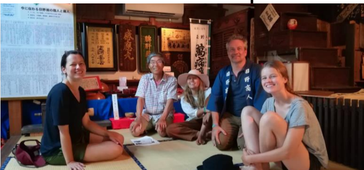
Homestay - Iwate