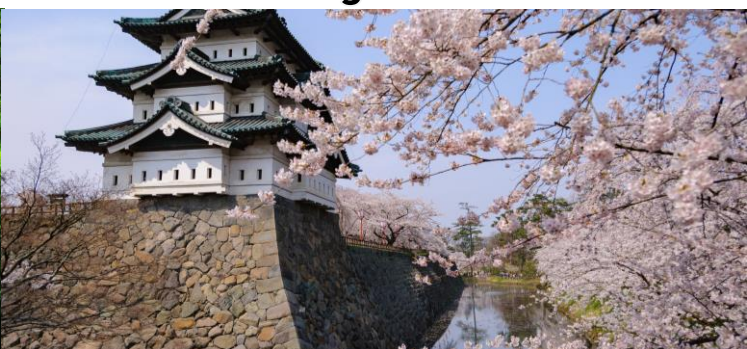
Hirosaki Castle and Sakura