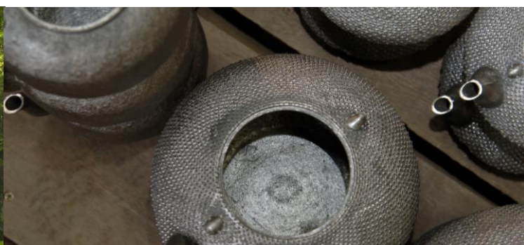
Ironware workshop visit